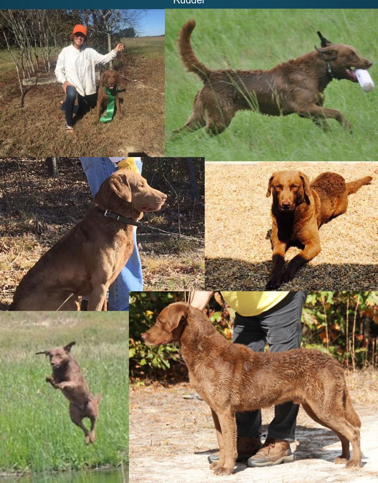
Mountain Island Rudder Amid Ships Full Ahead JH WDQ "Rudder"